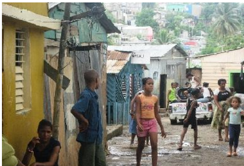
The La Barquita Neighborhood