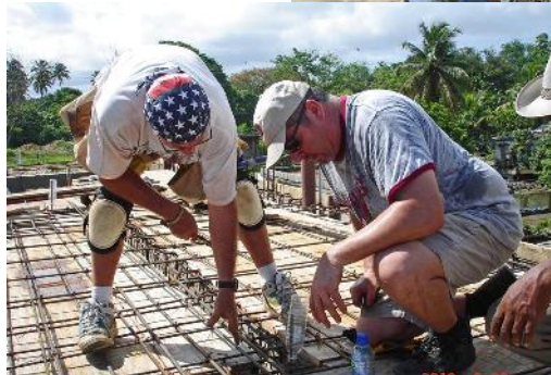
The teams tied a lot of rebar during the summer of 2010, and placed a lot of formwork. There will be a lot of finishing work in 2011.