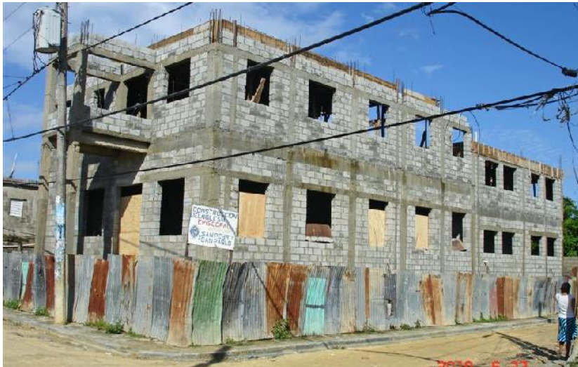
San Pedro & San Pablo shortly before the roof was poured in 2010.

who, in conjunction with the DR Diocese, provided the physical and financial resources to pour the foundation, raise the walls, and build the reinforced concrete roof for the first floor. This included constructing an extra-sturdy foundation due to a high ground water level at the site, and the potential for flooding. Then in 2010 the Tampa Deanery again sent 43 persons in three teams to work on the second floor. Alongside their Dominican counterparts, who had previously raised the walls to roof level, they completed the reinforced concrete roof for the second floor.