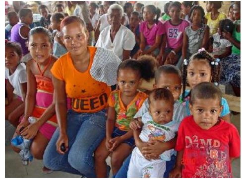
Children who would potentially attend colegio San Pedro & San Pablo.

Background: The congregation of San Pedro & San Pablo was founded in the early 1990's as a mission of nearby San Felipe in Sabana Perdida. At first San Pedro & San Pablo met in a family's home, but shortly after its founding it rented one-half of a small house to serve as the home for the new mission, and later moved to its present rented house. Around 10 years later the diocese was able to purchase the present lot.